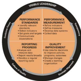
Public Health Performance Management System

The Board of Health Quality Committee provides guidance on quality improvement goals to ensure alignment with the Strategic Plan and work toward continuous quality improvement. One example of continuous quality improvement in 2017 was the Environmental Health Improvement Center project that focused on conducting customer satisfaction surveys to improve the customer experience.