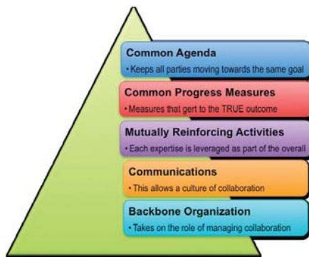
Collective Impact Framework

Continuity of Operations (COOP) Plan For Winnebago County Health Department October 26, 2016